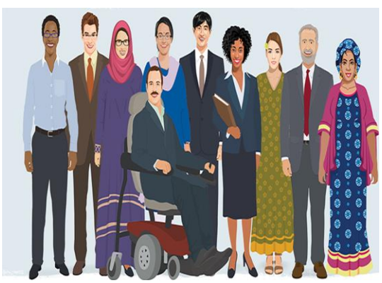
Professional Education for SAI Auditors – Pilot